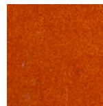
Bright selenium orange

As quatro peças desta reedição, produzidas nas cinco cores originais, sugerem um jogo de volumes com desenho modular e geométrico, do qual podem resultar múltiplas combinações.